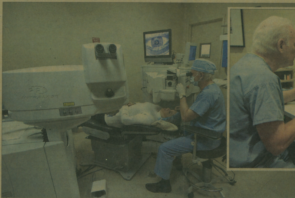
Seen here some shots of the Herzig Eye Institute in Toronto. The institute offers everything from cataract surgery to Lasik procedures.